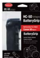
HC-5D Pro For Canon 5D Mk II Digital SLR