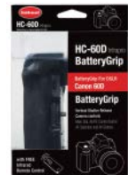
HC-60D Infrapro For Canon 60D Digital SLRs