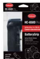
HC-650D For Canon 650D/600D & 550D Digital SLR