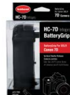
HC-7D Pro For Canon 7D Digital SLR